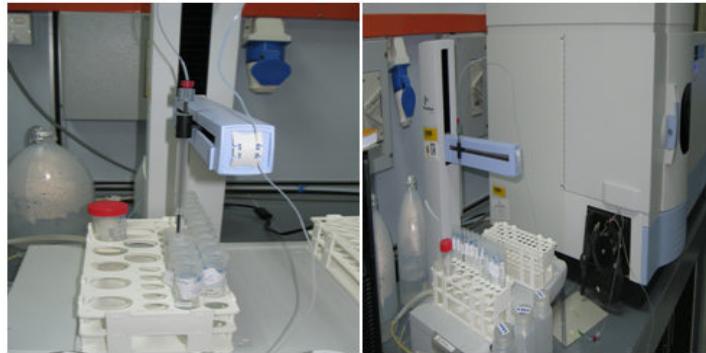
Figure1 The process of determination the concentration of heavy metals in blood and urine samples by (ICP-MS) instrument.