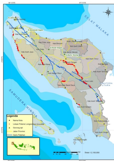
Figure 2. Map Location of Avalanche of Aceh Province