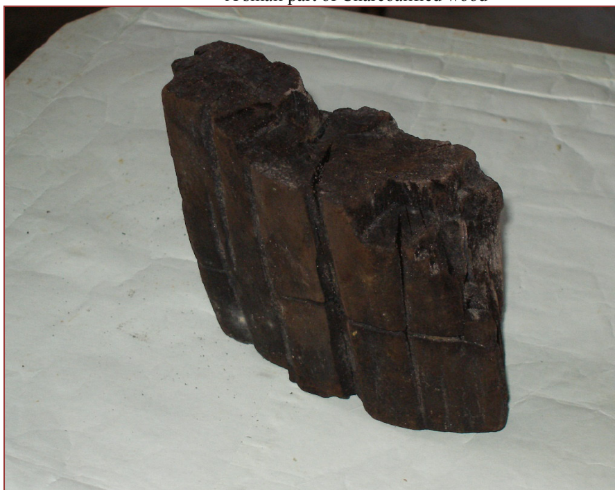
A small part of Charcoalfied wood

The material was collected from the Mine-II of the Neyveli lignite field and it is a small part of a long charcoalfied wood (about 16 m long and 95 cm in diameter). Hand sections (TS, TLS, & RLS) were prepared from the wood fragment and the sections were mounted in DPX. The sections were observed in light microscopes and the microphotographs were taken using Olympus CCD camera attached with Olympus Trinocular Microscope.