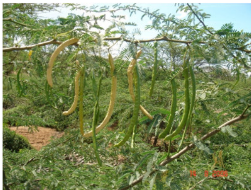
Plate 1: Prosopis pods seed profusely