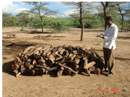
Plate 2: Thickets of Prosopis on shores of Lake Baringo in the background

The goats however, do not digest the seeds due to hard seed cover hence they are passed on in their dung which germinate vigorously under pasture land. Such undigested seeds are also washed downstream by floods towards Lake Baringo and rivers in the study area which enhances their dispersal. In areas where the plant has been cut for charcoal production it coppices heavily with each stool producing on average 5 shoots. This also increases the density of the plant in the study area. The Density of prosopis increases as one approaches Lake Baringo where there are alluvial deposits and plenty of water and decreases towards Marigat Kambi Samaki road where soils are generally coarse and stony.