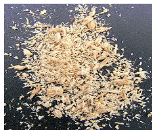
Figure 1 Pictue of saw dust

Sawdust is a by-product of cutting, grinding, drilling, sanding, or otherwise pulverizing wood with a saw or other tool; it is composed of fine particles of wood and can present a hazard in manufacturing industries, especially in terms of its flammability. Added to decreased production and less supply to meet what had been the demand, there has been increasing demand for sawdust from the bio-energy sector as more consumers are incorporating pellet stoves and pellet-fueled hot-water boilers into their homes. This has led to increasing numbers of wood-pellet producers, especially in the the northern and northeastern states. The increased demand for sawdust and increased price for the commodity has primarily impacted livestock producers, particularly dairy farmers and hog producers who use sawdust as part of a composting system for decomposing quarantined carcasses. Ralph Overend (2010) .