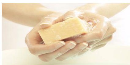
Figure 6 Natural soap

Fatty acids are straight-chain monocarboxylic acids, and the most common range in size from 10-20 carbon atoms and most often have an even number of carbon atoms including the carboxyl group carbon. The carbon-carbon bonds in saturated fatty acids are all single bonds, while unsaturated fatty acids have one or more carbon-carbon double bonds in their chains. One example of a saturated fatty acid is palmitic acid, \text{CH}_3\text{-(CH}_2\text{)}_{14}\text{-CO}_2\text{H} . Fatty acids are also seldom found as free molecules in nature but are most often a part of a larger molecule called a triglyceride which consist of a three-membered carbon chain (glycerol backbone) with a fatty acid bonded to each of the three carbon atoms in the glycerol backbone. The bond between the fatty acid and the glycerol backbone is referred to as an ester linkage.