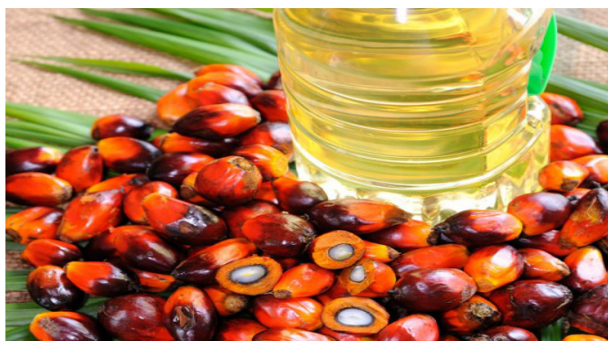
Figure 2 Palm kernel