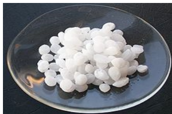
Figure 5 Pellets of sodium hydroxide.

are used to cure many types of food, including olives, oranges, eggs and cakes and are also valued for their cleaning effects. Sodium hydroxide is commonly its major constituent and it is used as commercial and industrial cleaners and clogged drain openers, due to its grease-dissolving abilities by decomposing greases via alkaline ester hydrolysis, yielding water soluble residues that are easily removed by rinsing. It can also be used to digest tissues of animal carcasses. In the event that lye solution touches the skin use of vinegar on the affected skin is also a first aid remedy.