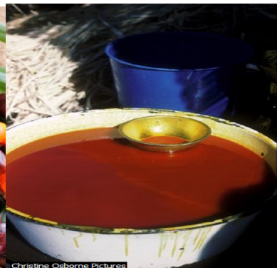
Figure 3 Palm oil

Several studies have linked palm oil and cardiovascular disease including a 2005 study conducted in Costa Rica which indicated that replacing palm oil in cooking with polyunsaturated non-hydrogenated oils could reduce the risk of heart attacks, and a 2011 analysis of 23 countries which showed that for each kilogram of palm oil added to the diet annually there was an increase in ischemic heart disease deaths (68 deaths per 100,000 increase) though the increase was much smaller in high-income countries. However, further results from several studies indicate that palm oil provides health benefits, and its consumption does not increase the risk of cardiovascular disease