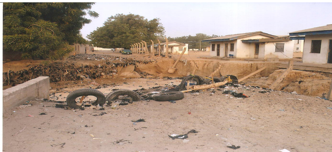
Plate 4.2: Cut off Road by Gully Erosion behind Mobile Police Barrack

The total annual rainfall for Maiduguri from 2003 – 2008 measures between 533 – 897mm. Greater percentage of the stated amount falls between May to September and at the onset of the rainy season, the scanty vegetal cover offer less protection to the soil. Rainstorm induces flash runoff leading to erosion. Cocheme and Fran quip (1967) opined that wherever mean annual rainfall exceeded 500mm, even in the Sahel zone where annual rainfall is low, considerable runoff can occur. When the runoff occurs in an area cleared of vegetation and exposed surfaces, as in most of the locations in the gully sites. Such intense storms can affect near surface mechanical eluviations, leading to the blocking of pores spaces, and reduction in infiltration rate. Hence, the gullies are formed by surface runoff from localized rainfall events of high intensity in the fine to coarse grained particles. The new extension of the gully channel has cuts off the footpath linking mobile police barracks and the police headquarters (plate 4.2).