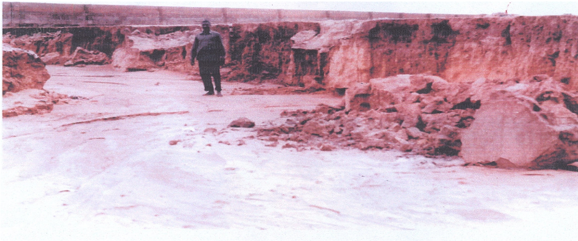
Plate 4.3: Gullying Process due to Sliding and Caving in Shuwari