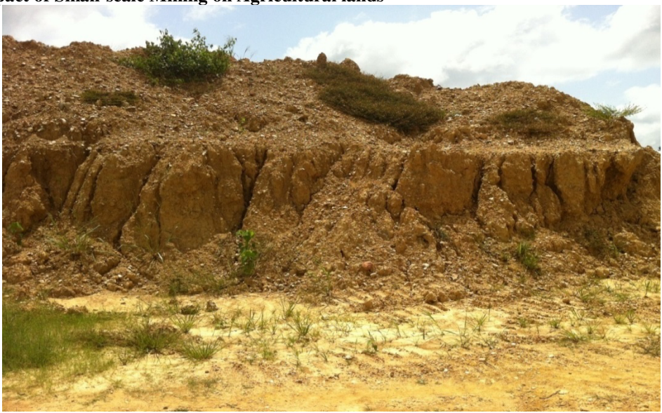
Plate 1: Impact of Small-scale Mining on Agricultural lands

In addition, the sampled household heads complained that large tracts of agricultural lands are also destroyed as a result of excessive vegetation removal and disturbance of soil structure. Growth supporting topsoil is usually removed during mining, and the land is rendered virtually incapable of supporting plant growth, in addition to being left exposed to erosion. The Field observations also confirmed this assertion.