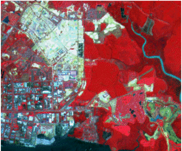
SPOT multispectral image of the test area

Based on the idea that different feature types on the earth's surface have a different spectral reflectance and remittance properties, their recognition is carried out through the classification process. In a broad sense, image classification is defined as the process of categorizing all pixels in an image or raw remotely sensed satellite data to obtain a given set of labels or land cover themes (Lillesand, Keifer 1994). As can see in figure1.