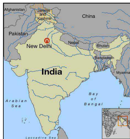
Figure 1: Map showing the study site

The study area, National Capital Territory (NCT) Delhi ( 28^{\circ} 36' 36'' N to 77^{\circ} 13' 48'' E), is the administrative capital city of India with 16.6 million populations (Figure 1). Delhi lies in northern India with a total area of 1,483 km 2 . There was single mode of transport in Delhi till 2002 when first Delhi metro was started. The number of in use vehicle population growth increased from 3.05 million in 2000 to 6.5 million on 30,985 km road length during 2010 (DoEF Delhi, 2010). There are five power plants (two coal based and three gas based) for electricity generation and a number of medium to small-scale industries in Delhi, which contribute total suspended particulate mass concentrations ( >500 \mu\text{g m}^{-3} ) to the environment in Delhi (Aneja et al. , 2001).