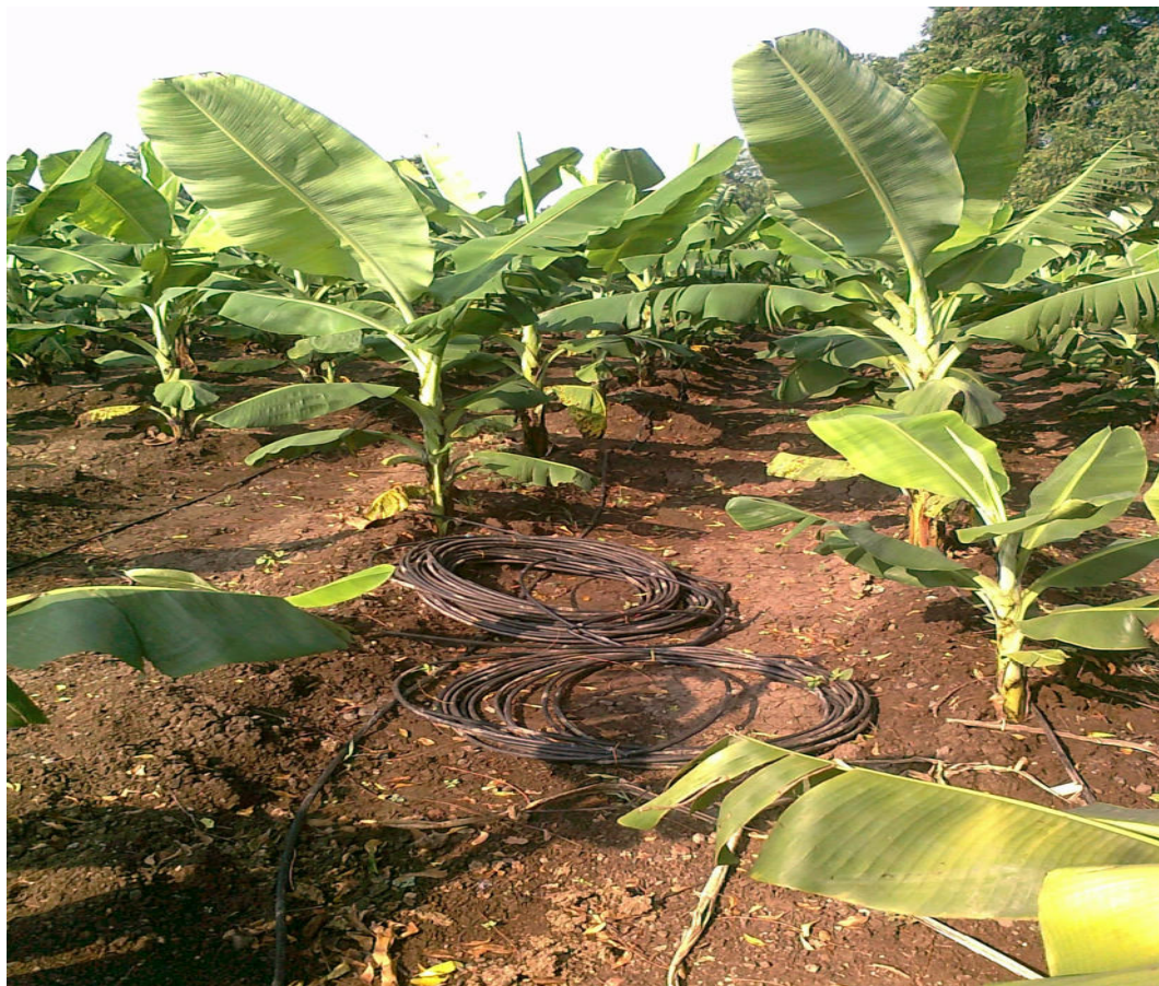
Figure 1. A type of Banana Drip pipe Irrigation system.