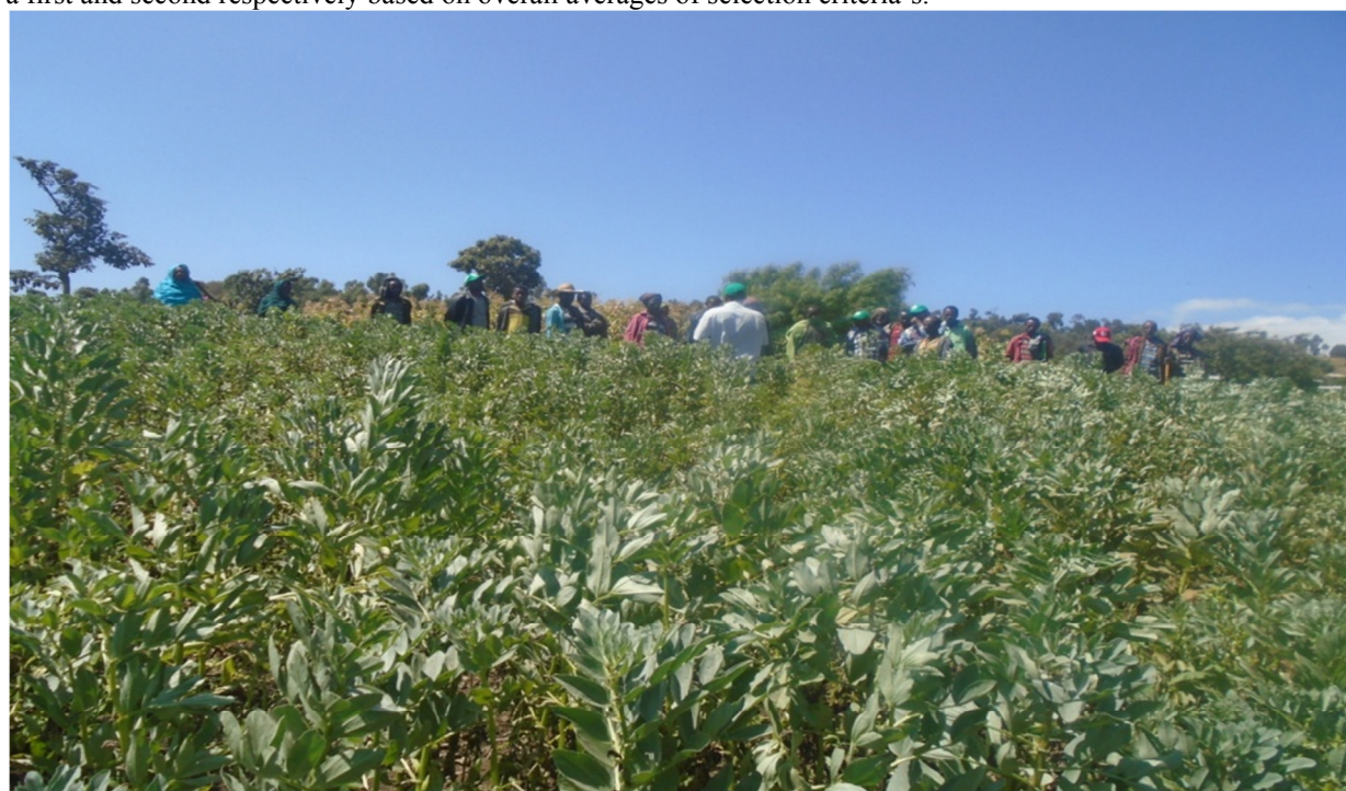
Figure1: Technology evaluation and selection on field day prepared at Chiro district.

Table 4 indicates that farmers, development agents and experts have selected Hachalu and Tumsa variety as a first and second respectively based on overall averages of selection criteria's.