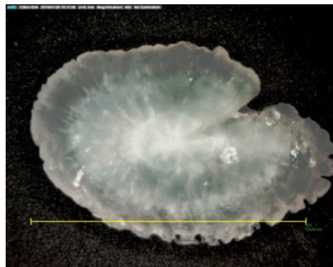
Figure (5) Otolith of Oreochromis zilli