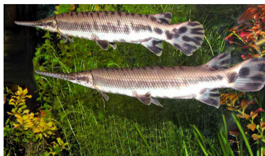
Figure (2) Lepisosteus oculatus

The difference between the two types can be noticed especially when looking at them from the head side or from the top as shown in Figure 3.