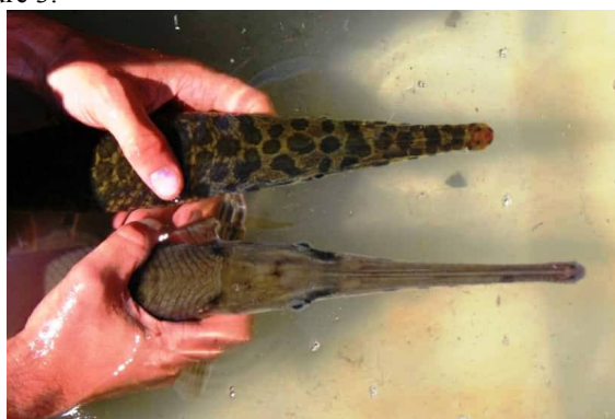
Figure (3) the difference between the two species of Gar fish

The difference between the two types can be noticed especially when looking at them from the head side or from the top as shown in Figure 3.