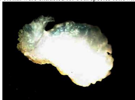
Figure(4) Otolith of Atractosteus spatula

Otolith shape: D. L. Buckmeier et al. (18) indicated the possibility of determining the age of the Gar fish from the otolith bones and the pectoral fins in addition to the estimated age of scales. The shape of the Gar otolith in this study showed in Fig. 4,. The otolith were extracted for both species following (19) and (20) .