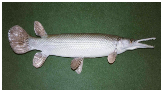
Figure (1) Atractosteus spatula