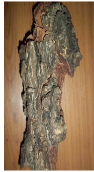
Plate I: Prosopis africana Stem-Bark