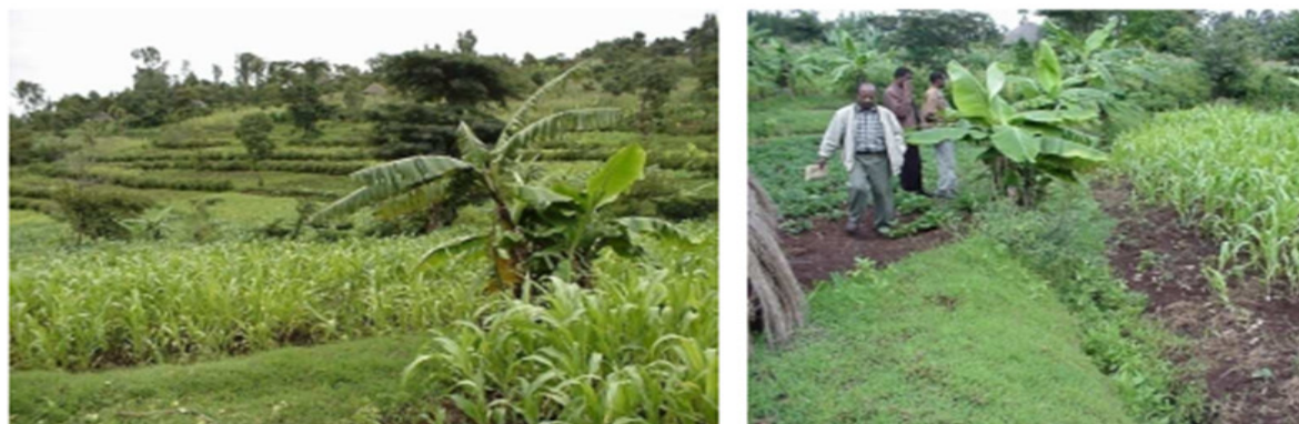
Figure3: Farmland terraces vegetated by various vegetative measures in Omo Sheleko Woreda.