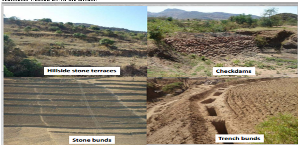
Figure2: Different soil and water conservation structures in Tigray, Ethiopia, Kifle (2012)

Physical or mechanical conservation include a wide variety of practices and structures in most cases are aimed to reduce slope of the land so as to stop or slow down the velocity of water that will cause erosion. Moreover, physical structure is implemented to control runoff and soil erosion in fields where biological control practices alone are insufficient to reduce erosion. According to Alemu and Kidane (2014), and Kebede (2015) mechanical structure such terraces, check dams, stone or/and soil bunds, trenches and micro basins modify terrain through changing slope length and angle, which in turn reduce runoff velocity, enhance water infiltration and trap sediments washed down the terrain.