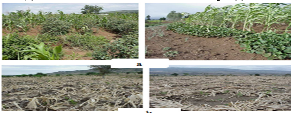
Figure5: Cha-sorghum-sweet potato, bean intercropping in Harereghe (a) and crop residue management (Konso)

Agronomic land management practice, which involves the growing of different kinds of crops in the same field. The crops grown together are, however, harvested at different times. Different agronomic measures (such as mixed, strip, and inter cropping, following, contour cultivation, mulching). According to MoA (2010), in Konso farmers are used to growing of 10-15 types of crops on the same field. The aim is to avoid risk of crop loss and reduce vulnerability to food shortage. Some crops are more resistant to or escape the adverse conditions of drought, pest and diseases. Annual crops are sown or planted in two seasons. Annual and perennial crops are planted and managed according to their seasonal calendar. Low fertility status, unpredictable and erratic rainfall, pest and diseases are some of the constraints limiting crop production.