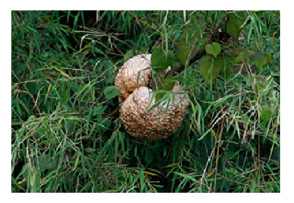
Plate 1: Engleromyces goetzei on live bamboo (Mwangi et al., 2015).

Engleromyces goetzei was collected in Mau Forest Complex, Gatimu area (2716 m above sea level, 00°38.862 S and 036°01.467 E) where the forest is closed and composed of bamboos. It was found on the upper stem of the bamboo, Arudinaria alpine . It was collected from a living, fairly thick bamboo culm (approximately 4-6 cm in diameter). It was identified and authenticated by a taxonomist in the Department of Biological Sciences of Egerton University.