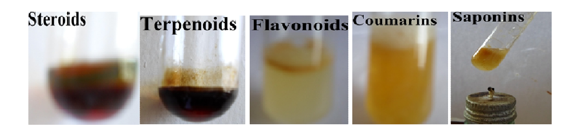
Plate 2: Phytochemicals present in Engleromyces goetzei.