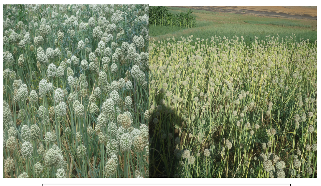
Figure 3. Onion production plots at M.lekhe (left and L.maichew (right)