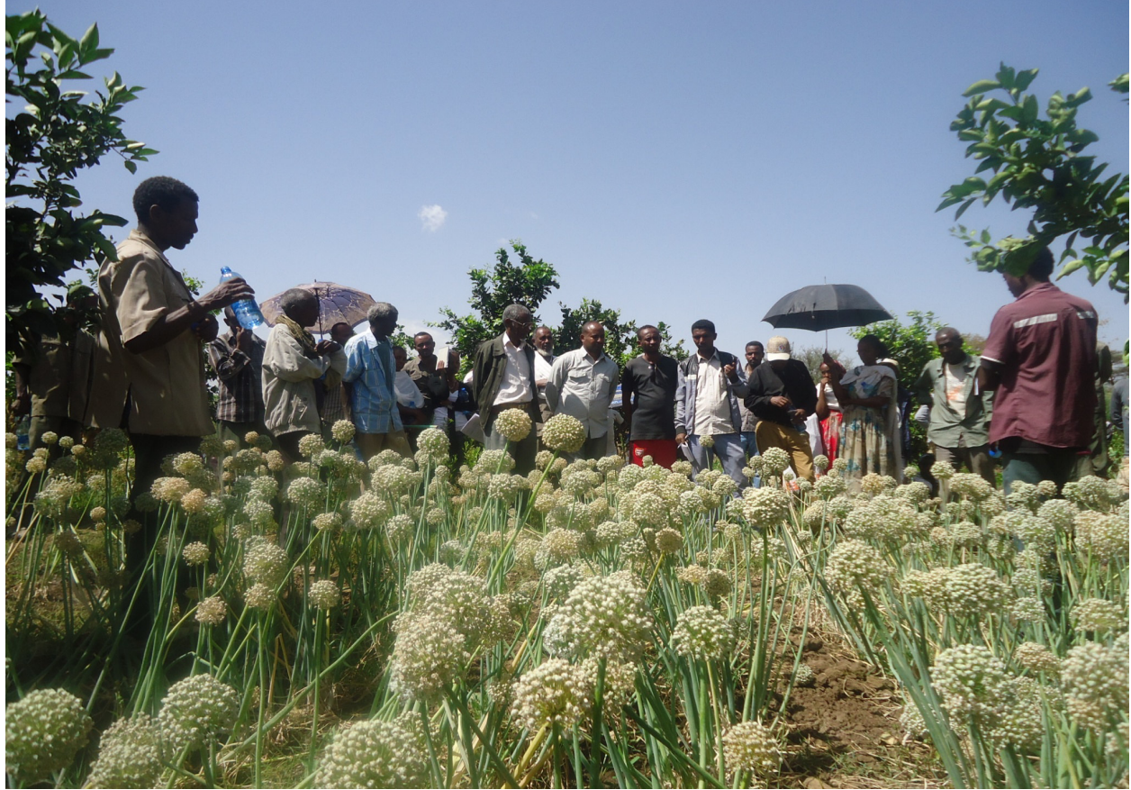
Figure 4. Stakeholders evaluation of the technologies at M.lekhe 2012 at field day