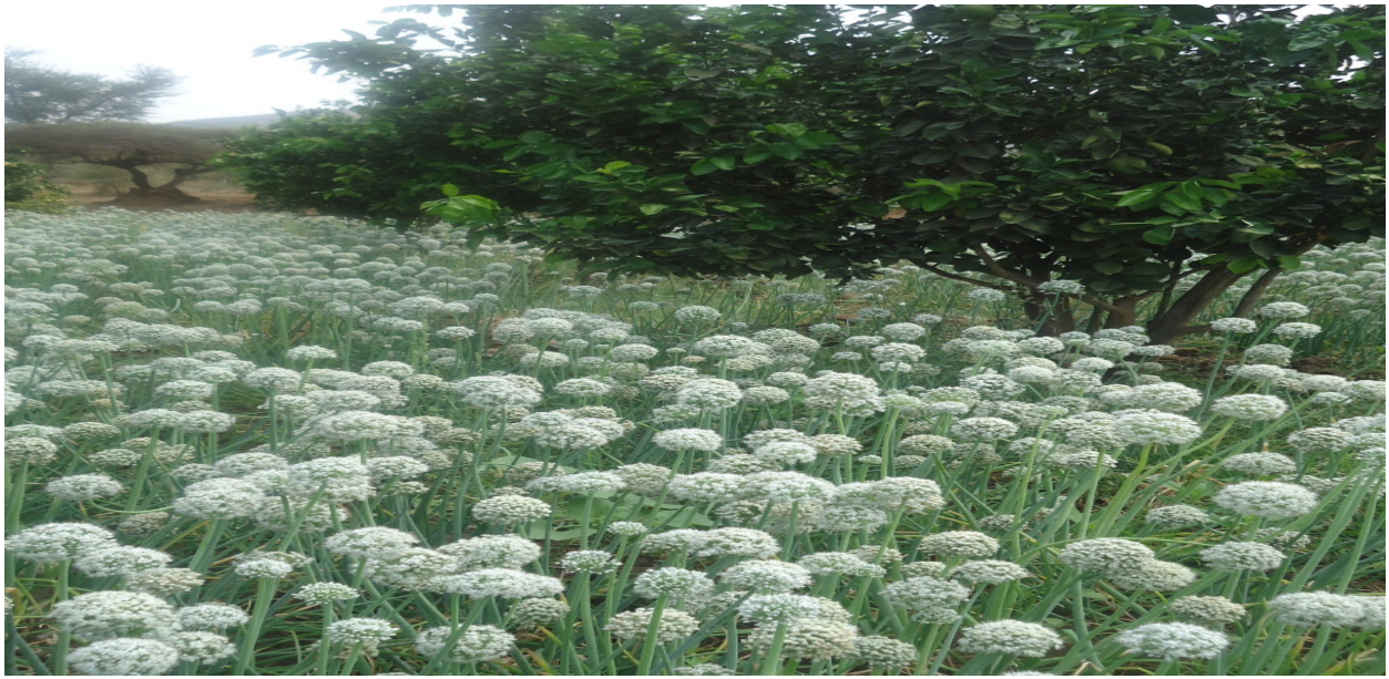
Figure 5 Onion seed production plots inter cropped with orange fruit at M.lekhe

According the stakeholders view; the onion variety given for onion seed production purpose was well adapted in our environment and gave good quality seed. This kind of research is important to familiarize the community in onion seed production techniques as well as helps to produce and maintain pure quality of seed by ourselves. Farmers and stakeholders explained that there is a threat of disease introduction through illegal seed market from unknown source. So this local seed production system can reduce this risk. Adequacy and quality of vegetable seeds are crucial for increased production. This means thatthe seed of needed traits should be timely acquired from reliable sources to ensure high determination and increased yield. The problem of lack orshortage of appropriate type of improved seeds of vegetables which are needed by the market (Emana