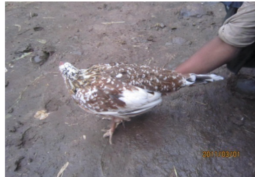
Key teteruma female