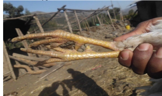
Yellow shank color