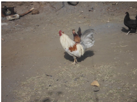
Kuarichama (sendekma) male