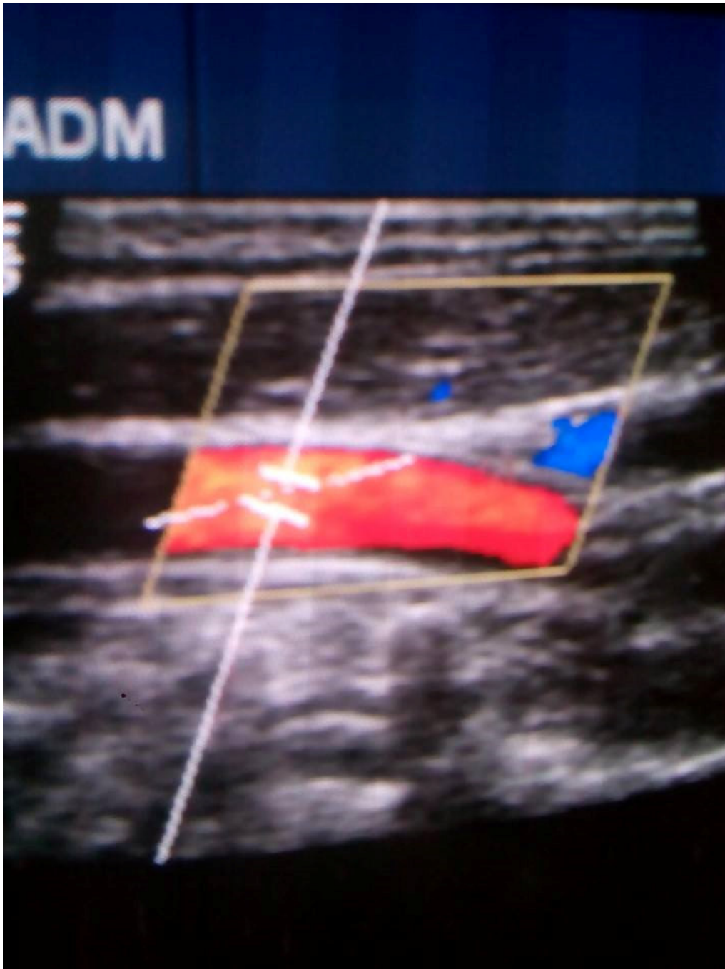
Plate 1: Blood Flow in the Carotid Artery