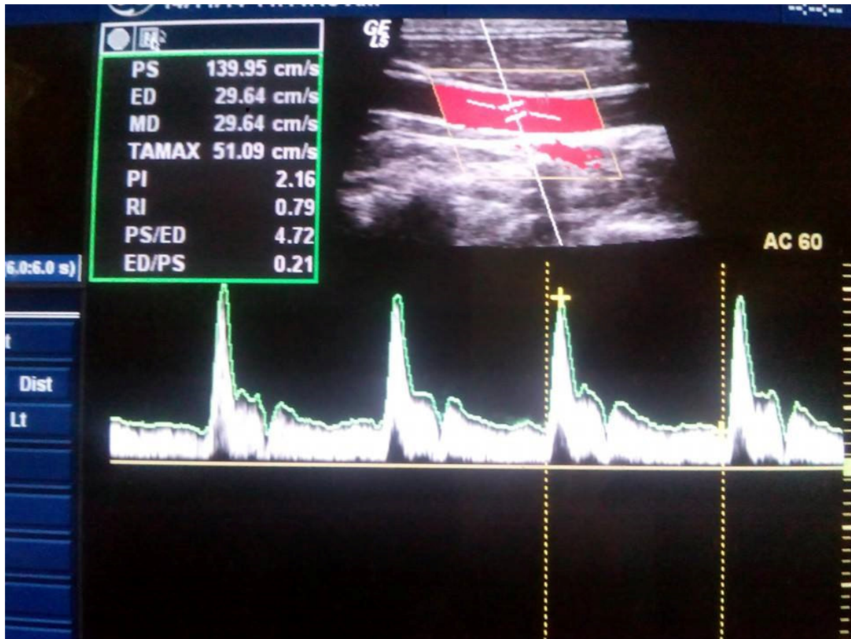
Plate 2: Monitor Display of Blood Flow Parameters