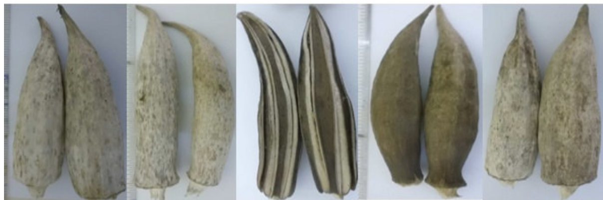
Agric short fruit