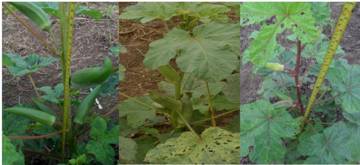
Agric short fruit