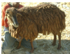
Atsibi ewe with course wool (local name is Jimo)