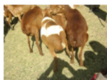
Fat-rump with short ear type of Abergelle sheep in Enderta district (Debri PA)