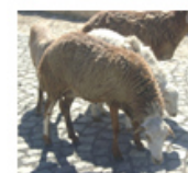
Short tail highland with pendulous ear type of sheep in Enderta district (Maitsedo PA).