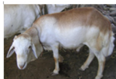
Elle ram in Alamata district