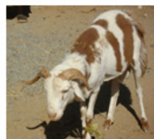
Horned Atsibi ram with shaded coat pattern