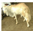
Elle ram in Enderta district (Maitsedo PA)