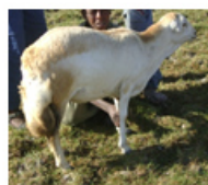
Elle ewe in Alamata district