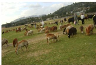
Flock of sheep with cattle in Ofla district (Wenberet PA)