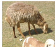
Common highland sheep with course wool in Ofla (wonberet PA)