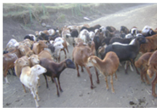
Flock of sheep and goats in Ofla district (Menkera PA)