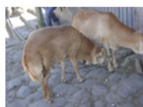
Cross of Elle and highland breed) without horn in Enderta district (Maitsedo PA)