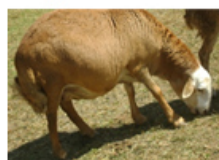
Hair type Common highland sheep in Ofla (wonberet PA)