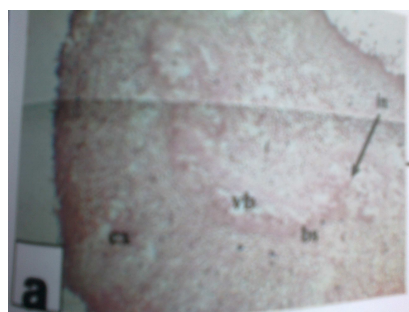
Plate A: Transverse section of the petiole of C. albidum showing semicircular petiole, uniseriate and rectangular epidermal cell, invaginated vascular bundle with an arc.