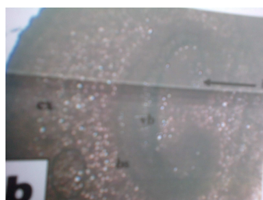
Plate B: Transverse section of the petiole of C. cainito showing semicircular petiole, uniseriate and rectangular epidermal cells and invaginated vascular bundle with an arc.