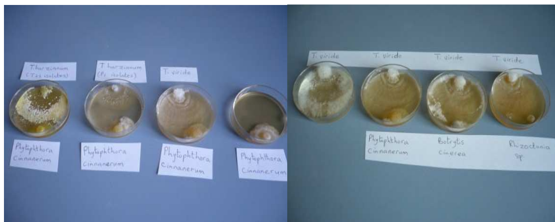
Plate 3: Competition assay between Trichoderma and pathogenic fungi ( P. cinnanerium )

Plate 3 shows the bio-assay competition between Trichoderma harzianum (T 22 and P1 isolates), T. viride and P. cinnanerium in the laboratory. It was evident that Trichoderma species grew faster, overlay P. cinnanerium and prevented its further growth and development. Trichoderma species proved to be aggressive competitor over P. cinnanerium . Plate 4 shows the competitive bio-assay between Trichoderma viride and pathogenic fungi ( R. solani , Botrytis cinarea and P. cinnanerium ). It was evident that T. viride grew faster to inhibit further growth of the pathogenic fungi ( R. solani , Botrytis cinarea and P. cinnanerium )