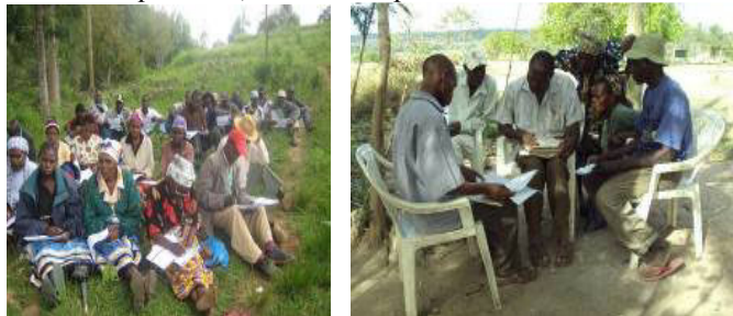
Plate 1: Focused group discussion sessions between the farmers and researchers from the University of Nairobi and Kenya Agricultural Research Institute (KARI).

Focused groups' discussion sessions were organized for a whole day for each of the two groups at Kaloleni and Kilifi. Discussions involved over thirty farmers in both locations sampled purposively by invitation, and the scientists from CAVS and KARI-Mtwapa (Pate 1). The discussions were carried out with help of structured discussant questions, with the help of identified facilitators from attending scientists.