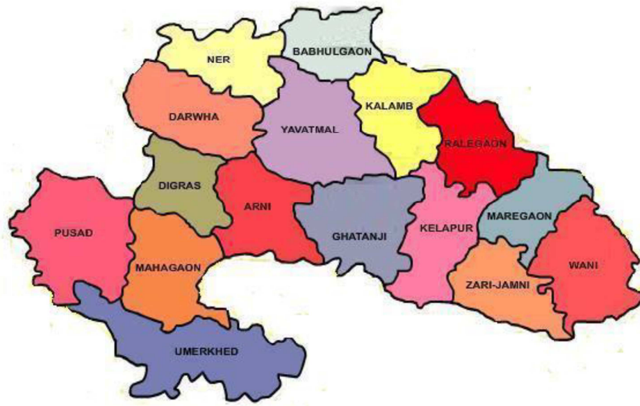
Fig 1- Taluka-wise clustering of Cholera cases