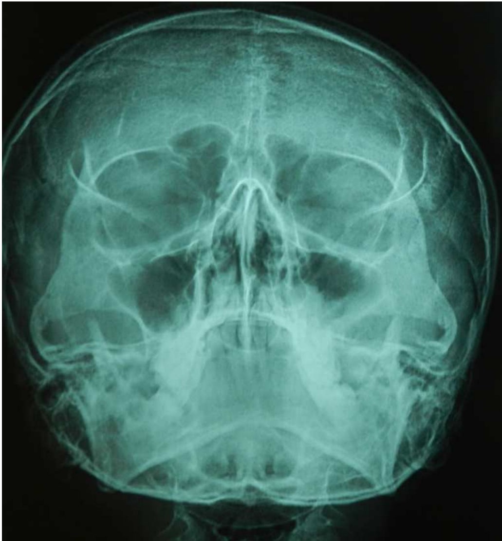
Figure 3. One and Half Months' Post-operative Radiograph Showing the Normal Radiolucency in the Left Maxillary Sinus