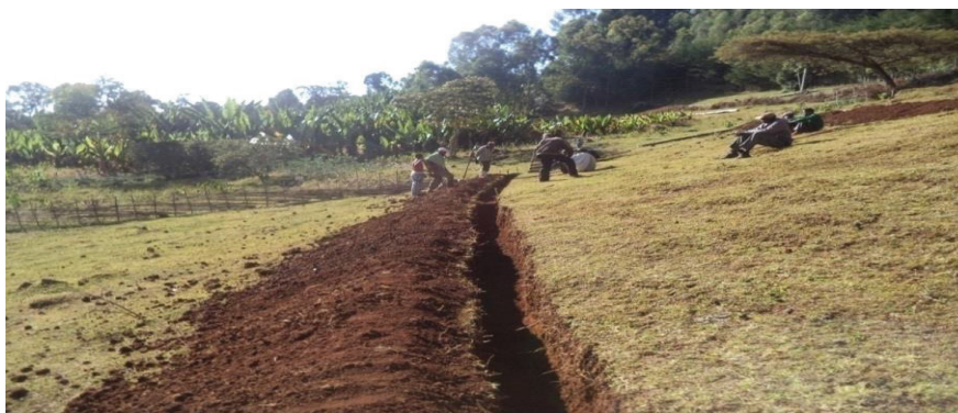
Fig.2. Soil bund at the Gozo-bamush kebele; Source: Own survey, 2014 (captured at 10:00 AM)

Terracing controls erosion by shortening the length and minimizing the gradient of the ground slope. According to Kebele DAs, it enables a farmer to minimize soil and water loss through facilitating water percolation. Moreover, as one of the MWARDO expert revealed physical SWC in the area were partially practiced few years back. However, low quality of structures, destruction of the structures by human and animals and absence of planting trees in front of the structures were identified as the problems.