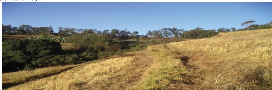
Fig.3. Elephant grass amid soil bund at Mada-kuiel Kebele

The findings of this study has indicated that the major challenges of FLMPs identified in the study area include poor arable land management and population pressure answered by almost all of the SHHs, followed by deforestation by 98.8%, culture and overgrazing by 94% while lack of awareness by 93%, of the respondents. Generally as to respondents poor arable land management, population pressure, deforestation, culture, over grazing, lack of awareness, topography, poverty and soil erosions were the challenges for FLMPs in the study area respectively ( Table 13 ).