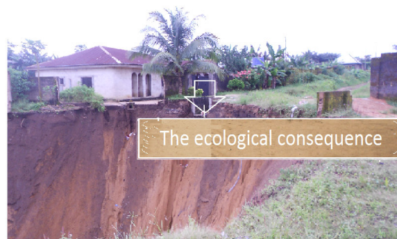
Fig. 5 Ikot Nkebre ecological site in Calabar (Image No. 002)