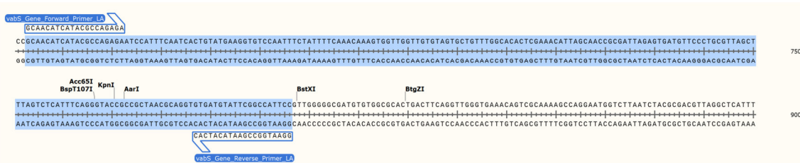
Figure 5. Screening of PCR amplicon region with two primers designed in the study (SnapGene 4.0.7, original)