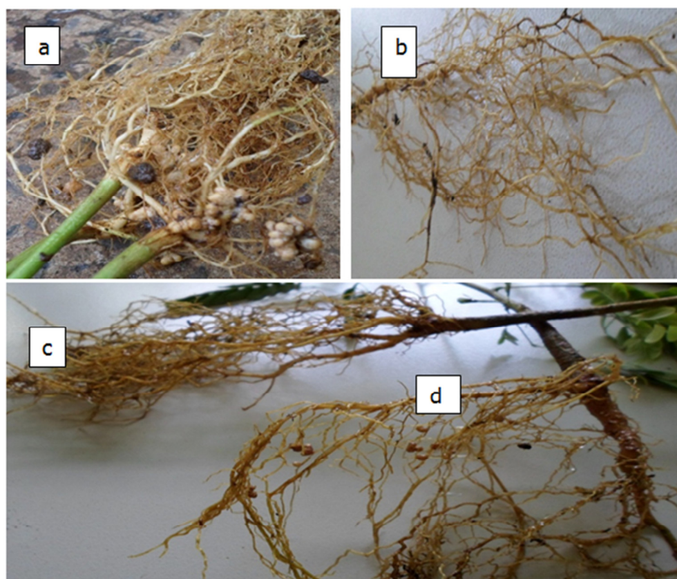
Plate 3: Tephrosia vogelii a treated plant with root nodules and b the control; Leucaena leucocephala d treated with nodules and c control plant.