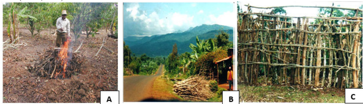
Figure 3. Uprooting and burning CWD infected trees (A), Use of infected trees for fire wood and house construction (B & C)

Cultural weed control activities like slashing and digging should be avoided in CWD-prone coffee fields, and agronomic practices (pruning and stumping) that bring about wounding in coffee trees should be done with efficiently disinfected tools. Disinfection of farm implements such as machetes, bow saws and pruning shears with potent disinfectants (>75% alcohol) followed by intense heating with fire is strongly recommended to farmers whenever pruning, rejuvenating old coffee trees and thinning newly suckers. Farmers' field schools recommend growing cover crops such as Desmodium sp. and haricot bean, which are very efficient in suppressing weeds (so reducing the need for slashing) and as legumes, promote the growth of coffee trees. Applying ash, mulch and slashing between plots with hand weeding around coffee trees were also promising treatments in CWD control trials (CABI, 2005).