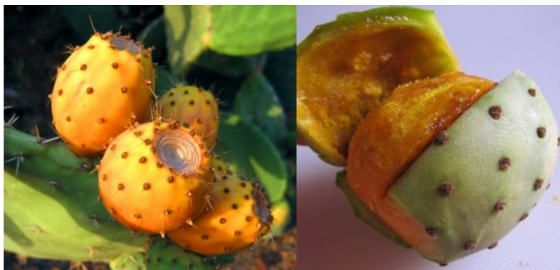
Figure 1: Prickly pear ( Opuntia ficus indica L.)

For analysis, triplicate determinations were performed on each sample; data shown later represent the means of three measurements.