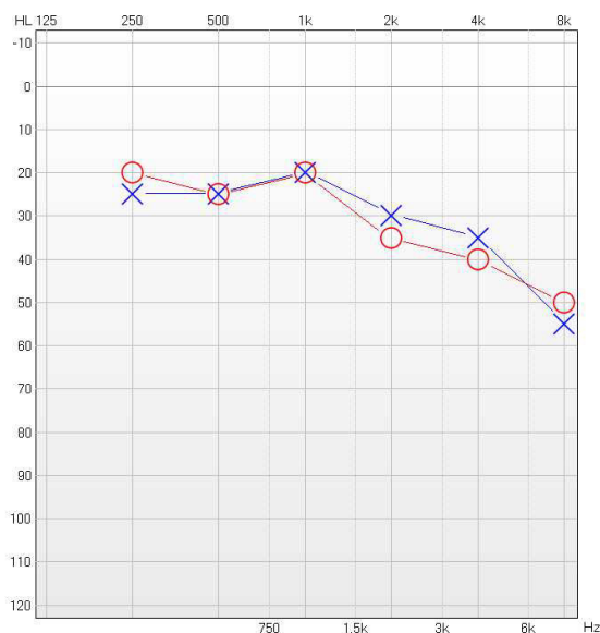
Figure 2 : Sloping Audiogram (chimehealth.co.uk, 2013)

A sloping audiogram indicates that a patient has better hearing in the low frequencies. An audiogram with a sloping configuration displays a generally downward trend in thresholds. That is, thresholds are low in the low frequencies but become higher in the high frequencies. This is the type of audiogram found in presbycusis, although it can also be found in other conditions including noise-induced hearing loss and sudden hearing loss