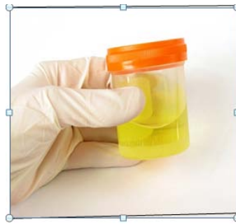
Figure 3: Urine collected in this tube in hospital from women have weak in fertility