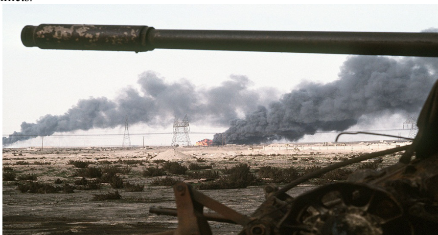
Figure [2]: Air Pollution as a Result of Wars (VICE News, 2015)

Wars also affect water resources mainly through naval fleets and submarines that launch missiles and nuclear explosions from underwater, which cause water pollution with chemicals, radiation, and harmful exhaustions that are fundamentally harmful to human health (Gleditsch, 1996). Many of the chemicals produced by wars have trapped the temperature in global earth, thus reducing rainfall and increasing drought, and increasing the size of the hole in the weight. Figure [2] shows an example of a air pollution resulted from wars and armed conflicts.