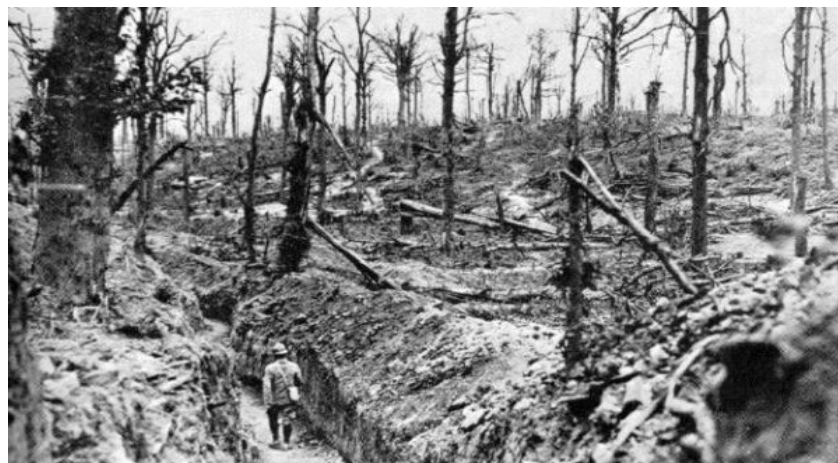
Figure [1]: Soil Pollution as a Result of Wars (Bausinger, Bonnaire, & Preuß, 2007)

Wars also affect water resources mainly through naval fleets and submarines that launch missiles and nuclear explosions from underwater, which cause water pollution with chemicals, radiation, and harmful exhaustions that are fundamentally harmful to human health (Gleditsch, 1996). Many of the chemicals produced by wars have trapped the temperature in global earth, thus reducing rainfall and increasing drought, and increasing the size of the hole in the weight. Figure [2] shows an example of a air pollution resulted from wars and armed conflicts.