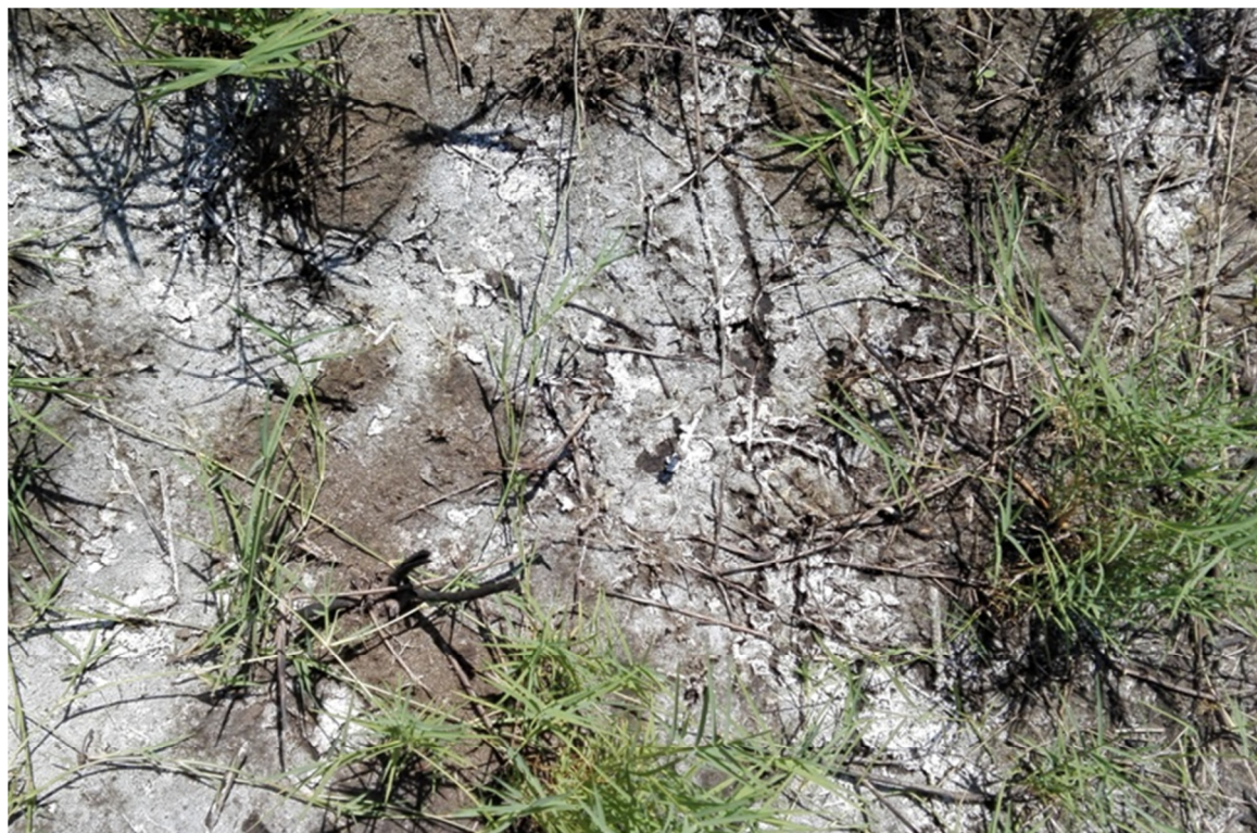
Plate 2.1: Saline soil in study area (Chanzuru, Kilosa)

Farmers' perceptions on salinity are defined by their understanding of factors influencing salinity and the consequences for crop production, and the way they judge the severity of the soil salinity for the fulfillment of their farming objectives in the light of the possibilities and constraints of their farming system (Kielen, 1996). Farmers' perceptions result from their knowledge of salinity occurrences, their farming experiences and salinity constraints. On the basis of this perception, the farmer defines a strategy to cope with salinity (Kielen, 1996).