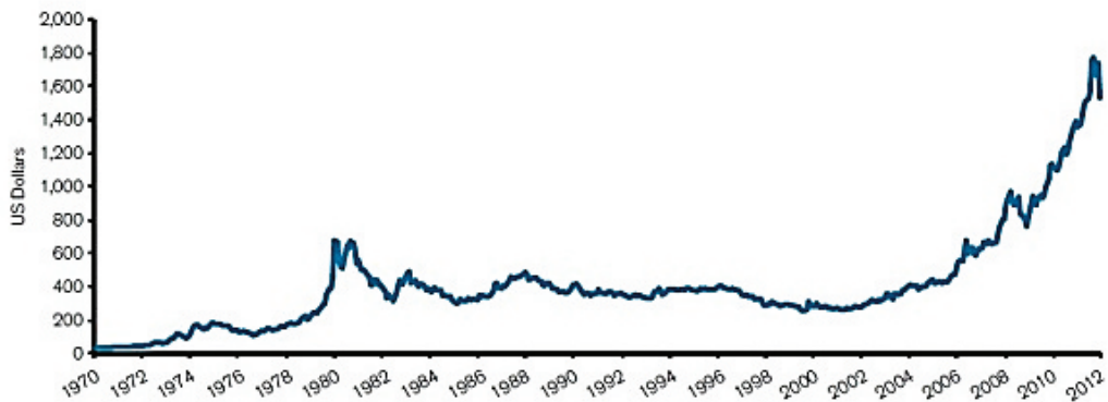
Diagram 2. Monthly evolution of gold price.

Besides, considering the reports of IMF, the increasing trend of the price of gold in the recent years, and also regarding the US government ability in controlling the inflammation ratio (from 1992-2012) (diagram 2) (diagram 3), it can be concluded that the US government was able to maintain its economic dominance and the amount of its assets in gold and dollar in relation with its closest competitors, regardless all its budget deficits and the periodical crises, the most severe of which happened in 2008. Therefore, as was observed in the recent economic crisis, the US government could not overcome these crises with the help of some emergent economic powers such as China; consequently, what was expected from the monetary and currency geopolitics in future could not be achieved without strengthening some of the new emergent economics in the east, South Asia and Latin America. The following table shows 24 countries in terms of currency and gold reserves and GDP (Kreps, 1934).