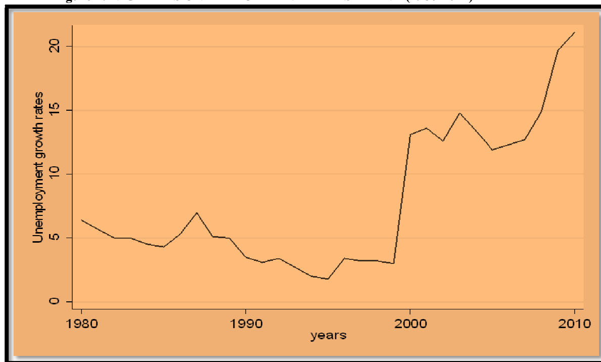
Figure 1: NIGERIA'S UNEMPLOYMENT RATES TREND (1980-2012)