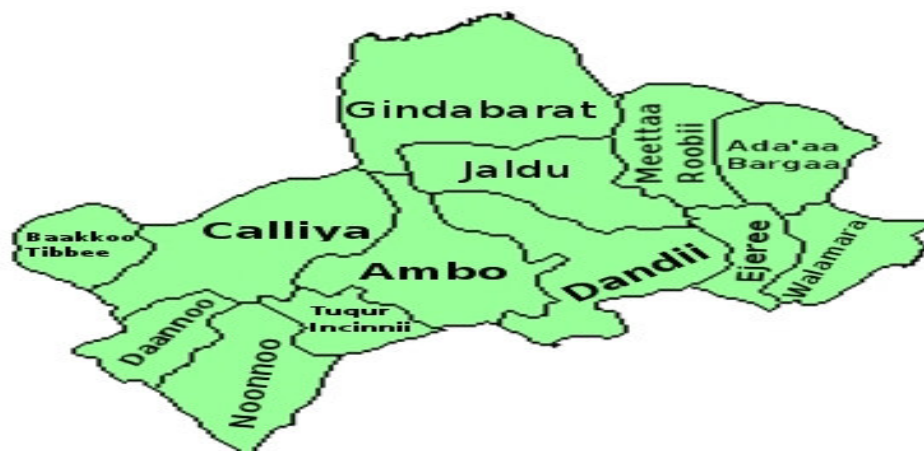
FIGURE 1: MAP OF BAKO TIBE DISTRICT

Bako Tibe District. According to Bako District Agricultural Office (2017) there are about 127,615 cattle, 3,438 sheep, 11,600 goats, 9,709 horses, 9,200 donkeys, 4,668 mules and 8,033 Poultry in the district. Climatically, the district is classified into dega (12%), woinadega (35%) and lowland (53%) zones. Most of the areas in the district range in altitude between 1600 m.a.s.l. and 2870 m.a.s.l. The vast area of the district receives rainfall between 1000 mm and 1500 mm. The annual mean temperature ranges between 13.2 °c - 32°C. The area receives maximum rainfall in the months of July and August. There are four government and private Technical and vocational colleges, there are two secondary and preparatory schools, there are a number of elementary and junior secondary schools, there are a number of kindergarten schools as well. Educational coverage reached about 87% as of Bako Tibe District office of Education, 2013. Besides there is 24 hours serving hydropower electricity source, digital telecommunication service, Ethiopian commercial Bank, Awash International Bank and Oromia International Bank in Bako Tibe District are some of financial institutions...such as Oromia Credit and Loan Association.