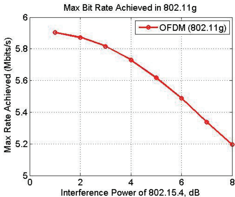
Fig.2.0: Maximum throughput for IEEE 802.11g

In 2003, the IEEE ratified the 802.11g standard with a maximum theoretical data rate of 54 megabits per second (Mbps) in the 2.4 GHz ISM band. As signal strength weakens due to increased distance, attenuation (signal loss) through obstacles or high noise in the frequency band, the data rate automatically adjusts to lower rates (54/48/36/24/12/9/6 Mbps) to maintain the connection.