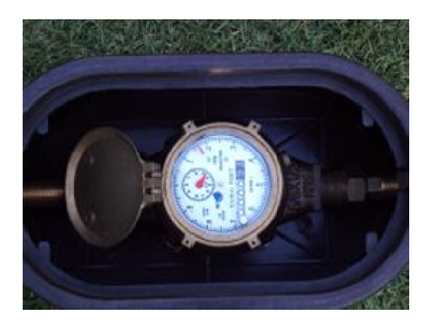
Fig 3: Water meter [11]

A water meter is a device which collects and registers information on the volume of water used over a period of time at a particular location. The subsequent information which is the volume of water used since the installation of the meter is used to calculate the amount charged by the water utility company to the customer for water usage at that location for that billing period [3].