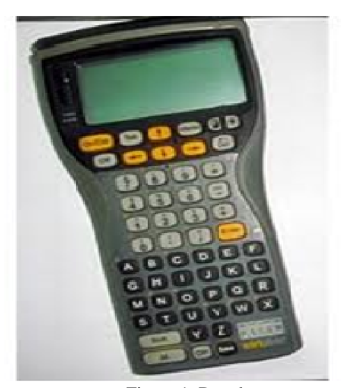
Figure 1: Data logger

Another method that was used for water meter reading was reading the water meter by using data logger. Data loggers are portable electronic machine (equipment) mainly meant for capturing data at sites. They are used for the same purpose to download data into the system after reading for the purpose of preparing customer bills. Although the introduction of data logger aimed at improving efficiency in water meter reading but still it was the same as the manual system which requires the water meter reader to deliver the device (data logger) to the office in order to download data taken from the site.