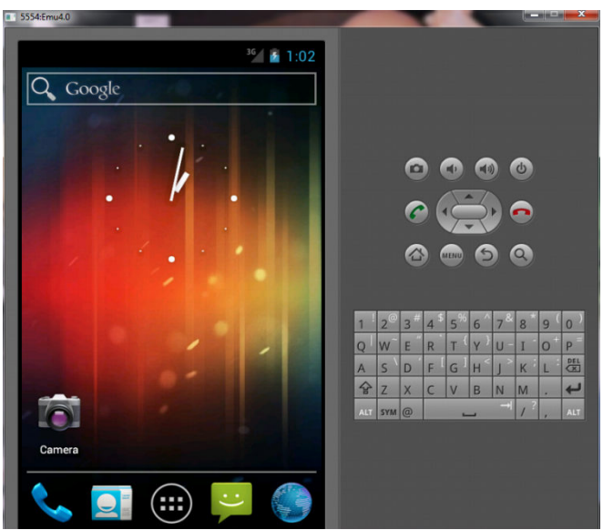
Fig. Screenshot 2