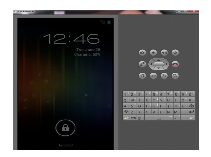
Fig. Screenshot 1