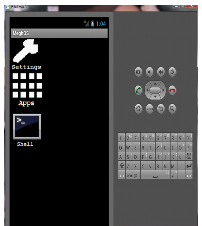
Fig. Screenshot 4