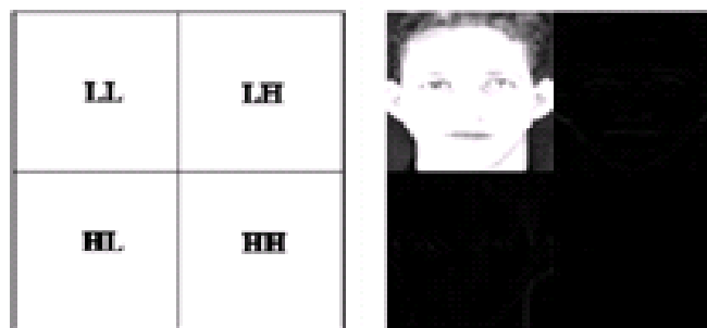
Figure.2 Face images with one-level wavelet transform.

Applying wavelet transform is the first stage of the face recognition system. The wavelet transform is used for two benefits. The first one is decomposing the resolution of the face image and thus reducing the number of input to the SVM. The second benefit of applying wavelet transform is to remove the density in all but the lower sub- band. An image is decomposed one time into four sub bands (LL, LH, HL, HH) as shown in Figure (2). The band LL is a coarser approximation to the original image. The bands LH and HL is recorded respectively the changes of the image along horizontal and vertical directions while the HH band shows a higher frequency component of the image. If the 112x92 decomposed one time the size of 1,2,3,4 sub-bands become 56x64.Hence the size of the input image is decomposed to the half.