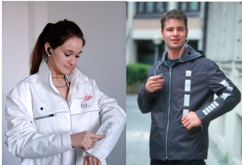
Figure 2 The wearable devices

Many AR systems have been developed for navigating spaces. It is rare to find one that also allows the user to easily create or modify a space. With most systems, one must view or listen to material created by others. It would require programming experience and extensive knowledge of the internal structure of the AR system to create a new environment.