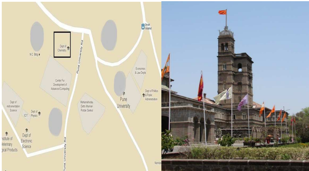
Figure 1 The map and the historic building at the specific location

On the left is a GUI representation of the augmented environment. (Department of Chemistry) The semi-transparent circles represent video stream. On the right is a photograph of the area we are augmenting, from the perspective Department of Chemistry. The stream consists of a single primary video, with other video plaited into the border. These plaits of video overlap the stream, with each plaits of video shifting into and out of recognition. The use of plaited video in addition to the primary video allows for the creation of highly individualized streams. For example, the primary video may be the reflections of an individual on the nearby architecture. The author's favorite video clip or animation could then be plaited around the edge of the reflections.