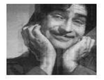
c) Reconstructed Image