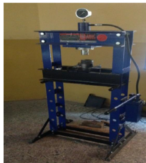
Figure 3.3: Press machine