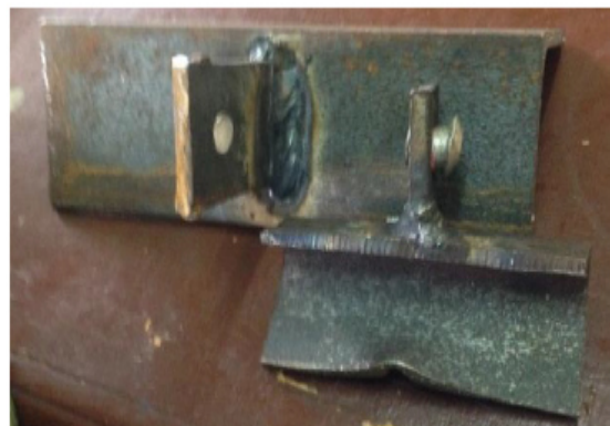
Figure 3.9: Sample of the work piece after Impact Test