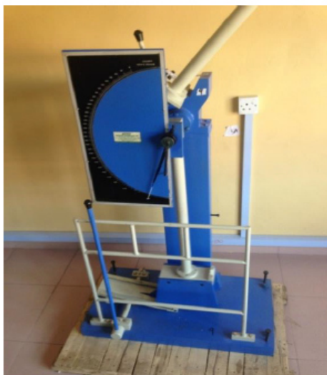
Figure 3.8: Charpy Impact Testing Machine

Figure 3.4 shows the Charpy impact testing machine and figure 3.5 shows the sample of the work piece with the rivet tested of impact energy.