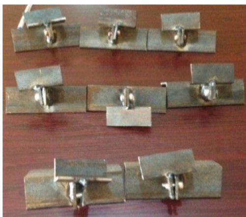
Figure 3.2b Fastened work piece samples with the three rivets