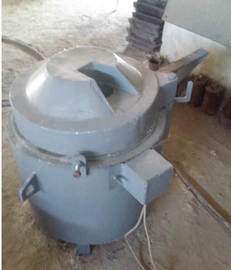
Plate 1: The painted salt bath furnace