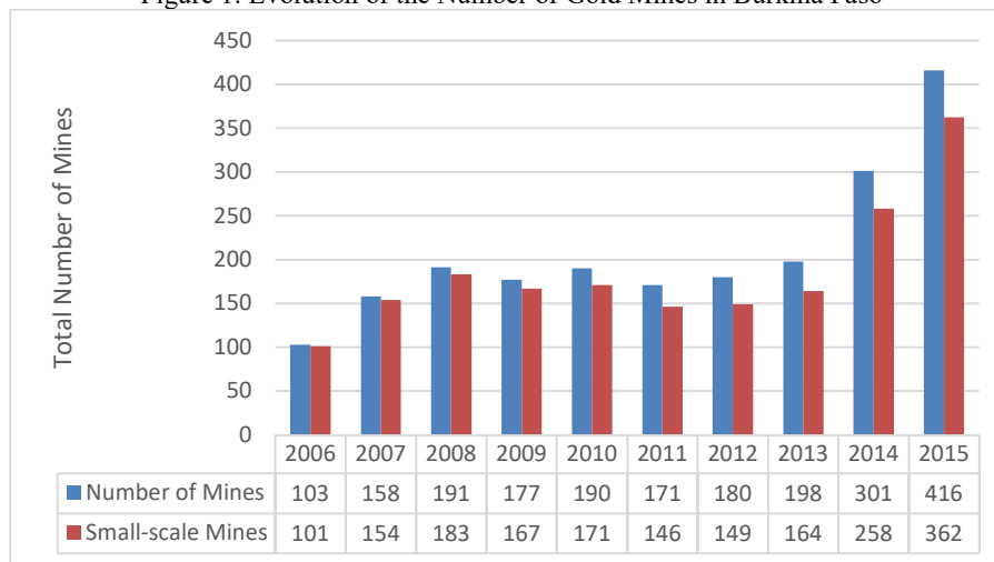
Figure 1: Evolution of the Number of Gold Mines in Burkina Faso

Created by Author based on Burkina Faso Ministry of Mines statistics