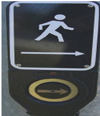
Figure 5: Pushbutton-integrated APS (Barlow, 2009).