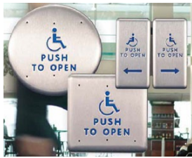
Figure 2: Shapes of buttons (Sweets, 2013).