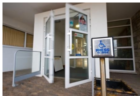
Figure 3: buttons can hang out side (The automatic, 2013).