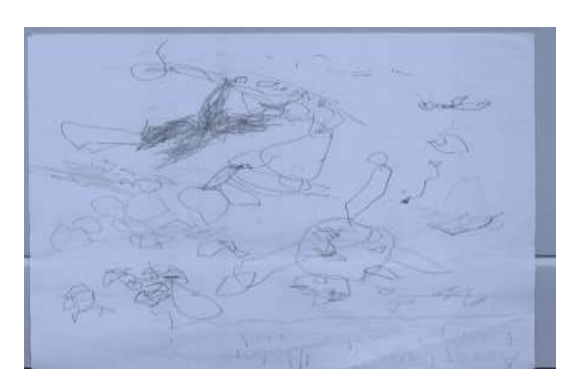
I (3 years)