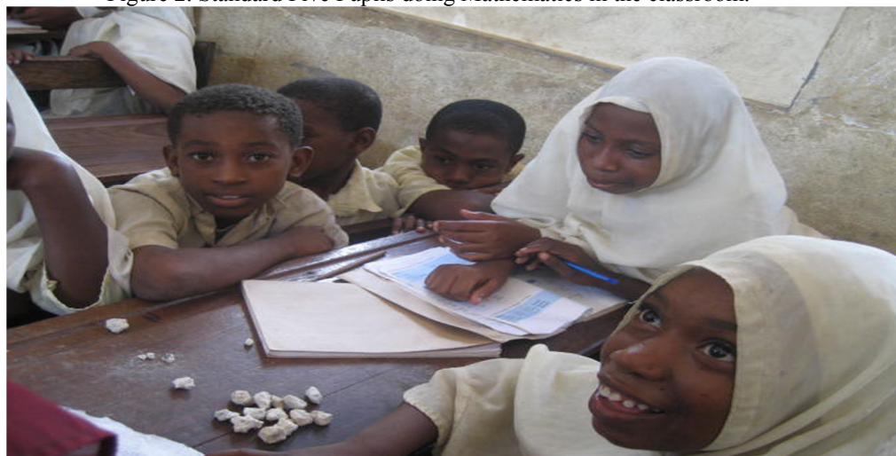
Figure 2. Standard Five Pupils doing Mathematics in the classroom.

Data from Figure 2 shows that pupils had low knowledge in understanding the subject which might be caused by the presence of incompetent teachers in the subject from the lower classes. A question here is if the majority of the pupils in class five were unable to subtract such a small figure, then how could they manage to attempt difficult ones at the upper levels? When the teacher was asked why pupils were counting stones at that level the answer was, “ Wanafunzi ni wazito na hawana msingi mzuri katika somo la Hesabu tangu darasa la kwanza ”. Meaning: Pupils were slow learners and they had no good foundation in Mathematics from Standard One. So if pupils in Standard Five were so poor in Mathematics then what do we expect them to do in classes six and seven?